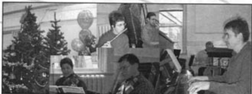
Some members from COUNTERPOINT COMMUNITY ORCHESTRA playing at The Children's Christmas Party held at The 519 on December 11, 2004